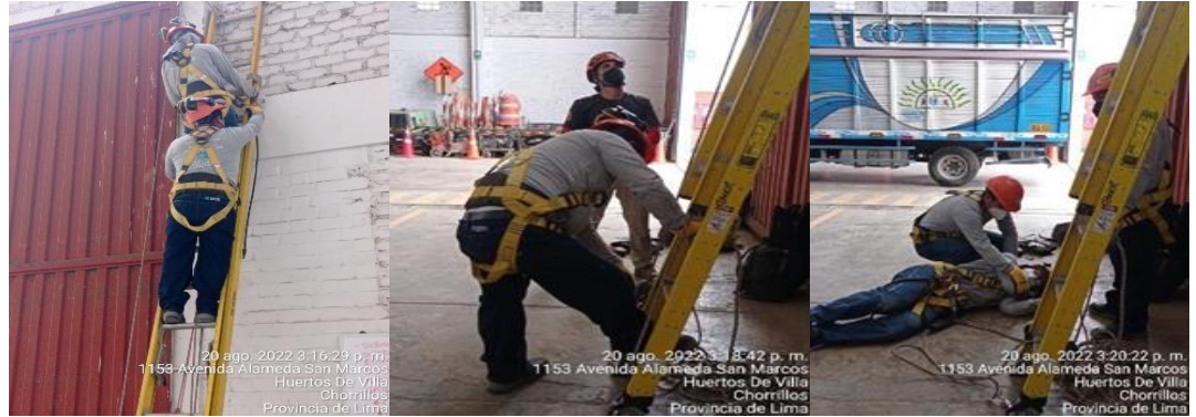
Note: Own elaboration of the training program INFORME GVB-INFORME-S&E-019-2022: GVB-TEA-1-2022

During the development of the induction and training processes, a strict permanent control was carried out to ensure the safety and integrity conditions of the participants, as stipulated in the protocol and guidelines of the Ministry of Labor and Employment. In the two groups, the measurements derived from the evaluation of the induction and training process with the two components (Theoretical and Practical) were developed.