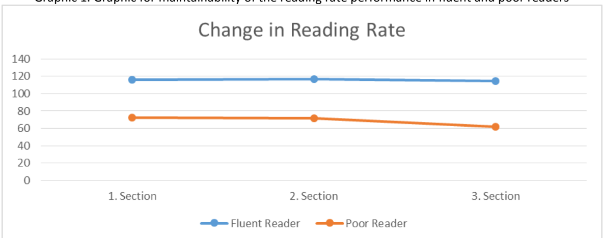
Graphic 1. Graphic for maintainability of the reading rate performance in fluent and poor readers

Table 5. Results of the Friedman test regarding fluent readers' scores of reading accuracy percentage in parts I. II and III