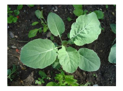
Brassica oleracea L. convar. acephala