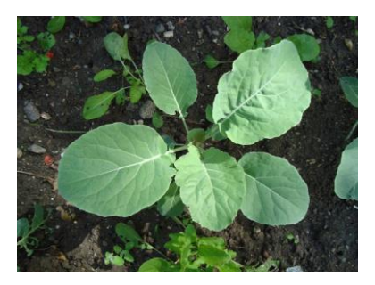
Brassica oleracea L. convar. acephala