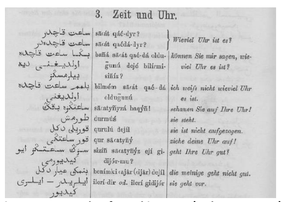
Figure 2. A sample of speaking part (Volume II., p. 6)

Speaking teaching is presented in the first part of the second volume of the work. Speaking part (Volume II, p. 1–56) is presented under 15 thematic main topics such as meeting and greeting, about the weather, time and hour, service, buying and selling, about eating and drinking, with the doctors, on the trip (railroad), voyage, at the hotel, in the coffee house, in the city (obtaining information), about the horses, conversation between friends in an oriental way and religious words (Arabic). When the themes selected in the work are considered, it is seen that the themes were prepared for daily life situations. A part of the third theme presented in the speaking part is exemplified in Figure 2.