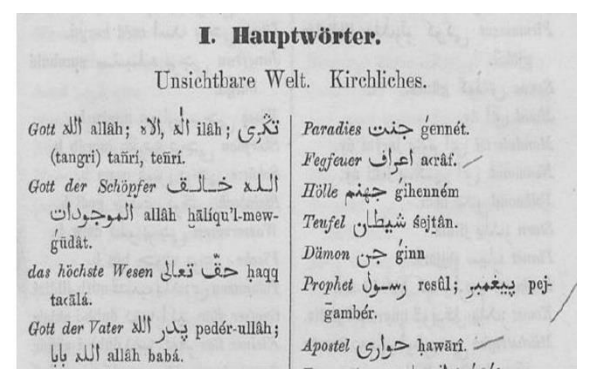
Figure 3. A sample of the vocabulary part

As seen in Figure 3, vocabulary lists are given as one-way (German-Turkish). In the vocabulary teaching part, the pages are divided into two columns. Unlike the speaking part, the words are transcribed in German, Ottoman and Latin letters, respectively. It is seen that the synonyms of some words are also included in some parts of the vocabulary parts. By giving synonymous words, it is aimed that students understand the meaning of words more easily and enrich their vocabulary. Vocabulary teaching is not done only through the lists mentioned above. Additionally, the words in the reading passages whose meanings are thought to be difficult for the students to comprehend are explained by giving footnotes.