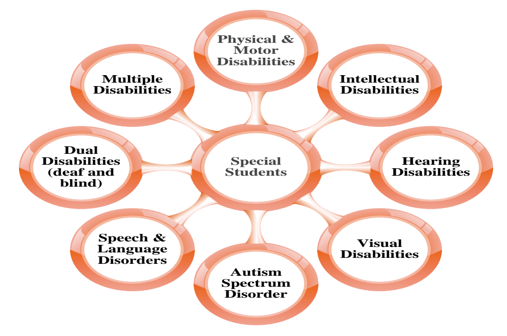
Figure 1: SEC policy consideration for special students

SEC policy offers a guiding framework for all Qatari independent schools that defines their responsibilities to children with disabilities. They should eradicate all barriers to access to all educational experiences at all educational stages, and consider all types of special student, as illustrated in Figure 1.