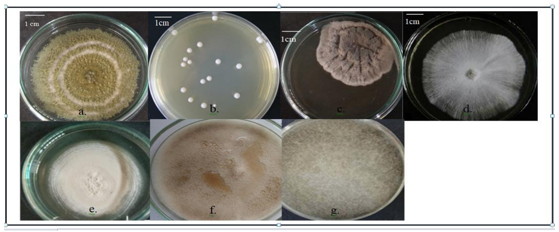
Figure 2. Diversity of post harvest fungi colony morphology in PDA medium to be observed in the poster. a. Aspergillus , b. Candida , c. Cladosporium , d. Fusarium , e. Paecilomyces , f. Basipetospora , and g. Rhizopus

The genera of post-harvest fungi were Aspergillus, Candida, Cladosporium, Fusarium, Paecilomyces, Basipetospora, and Rhizopus (Figure 2) collected from emping producers and distributors in Waringinkurung and Ciomas also known as the center of emping production in Kabupaten Serang, Banten Province. According to Arsal (2015), the expertise in processing melinjo into emping chips influenced its consistency and quality which are determined by the ripeness of the melinjo seed when roasting, pressure level during hitting the melinjo, evenness, and cleanliness of the emping chips produced.