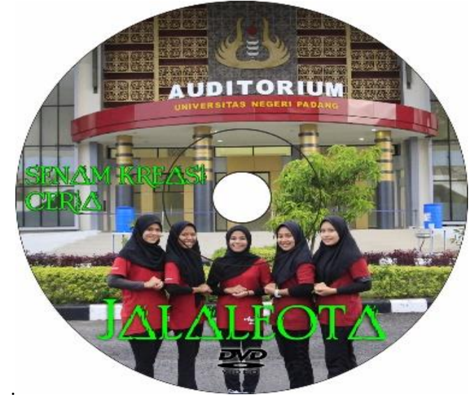
Figure 1 SKC Jalaleota Logo

The resulting product is the cheerful creation of Jalaleota in the form of VCD and uploaded on YouTube which can be accessed on Android systems and laptops. The use of Jalaleota cheerful gymnastic creations containing movements of walking, running, jumping, throwing and catching is very supportive to improve early childhood skills. Jalaleota cheerful creation gymnastics to improve motoric early childhood has a logo that reads 'SKC Jalaleota', which stands for jalaleota cheerful creation gymnastics, as shown in Figure 1