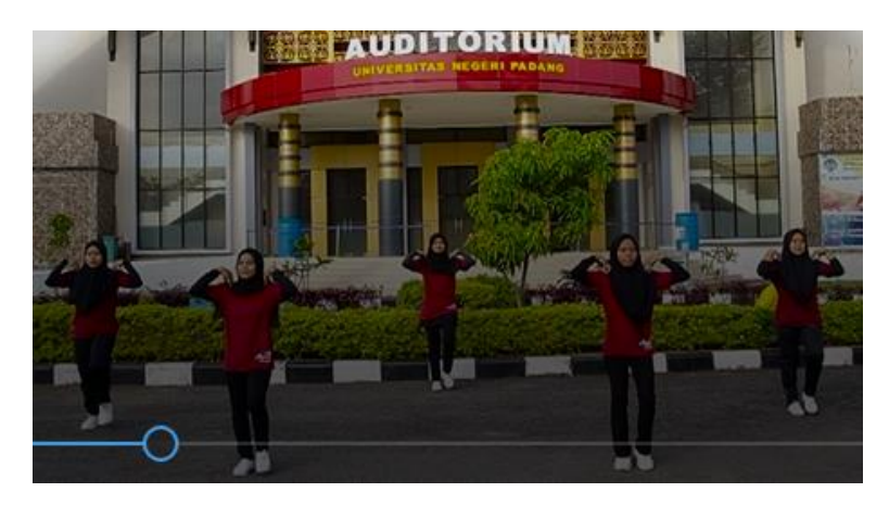
Figure 2. Example of the Shoulder Warming Movement

The cheerful creation gymnastics Jalaleota developed has three main parts consisting of heating movement, core movement and cooling movement. The warm-up movement is to raise the body temperature so that the body is ready to do the next movement, which is the core movement. This warm-up movement consists of the movement of the head, shoulders, hands and legs. This heating movement consists of 16 \times 8 counts. Where there are 4 \times 8 roads in place, 3 \times 8 counts of head movements, 4 \times 8 counts of shoulder and hand movements and 5 \times 8 counts of leg movements.