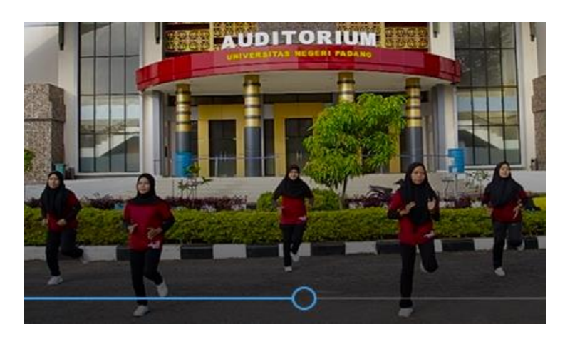
Figure 3. Example of Core Movements

Figure 2 shows an example of a warm-up motion on the shoulders and hands. In addition to the warm-up movement, there is also a core movement consisting of 18 \times 8 counts, which contains road movements, running, jumping, throwing and catching to improve the motor skills of early childhood, for example, jumping with one leg, as shown in Figure 3.