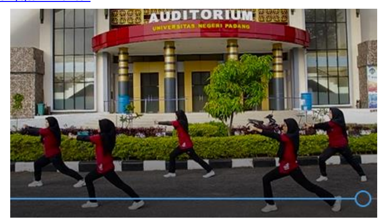
Figure 4. Examples of Cooling Movements

In addition to gymnastic movements, Jalaleota cheerful creations are made in the form of VCDs that have been equipped with music and video tutorials of movements. Jalaleota's cheerful creation gymnastics is also equipped with a movement guidebook as well as movement assessment, where this movement guide contains explanations or descriptions of every movement Jalaleota cheerful creation gymnastics performed. This book contains the title of the book, the name of the author and the explanation of the movement. The book also comes with an assessment of Jalaleota's cheerful creation of gymnastic movements, as shown in Figure 5.