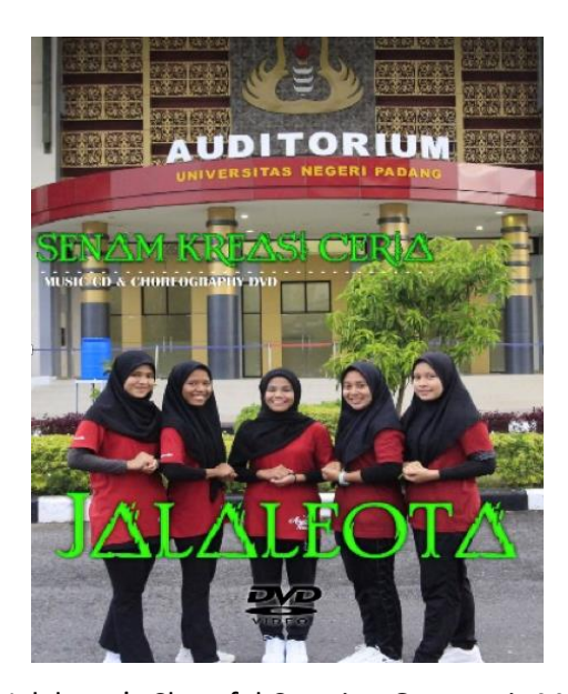
Figure 5 Jalaleota's Cheerful Creation Gymnastic Movement

In addition to gymnastic movements, Jalaleota cheerful creations are made in the form of VCDs that have been equipped with music and video tutorials of movements. Jalaleota's cheerful creation gymnastics is also equipped with a movement guidebook as well as movement assessment, where this movement guide contains explanations or descriptions of every movement Jalaleota cheerful creation gymnastics performed. This book contains the title of the book, the name of the author and the explanation of the movement. The book also comes with an assessment of Jalaleota's cheerful creation of gymnastic movements, as shown in Figure 5.