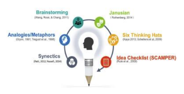
Figure 2. Brainstorming as one of creative thinking activities that effectively encourage students' creative thinking skills in learning science (Peng, 2019)

In addition, activities that focused on student centralization by giving autonomy to students to explore the content of knowledge using the help of technology to facilitate the learning process were also recommended (CrĂciun et al., 2016; Hu et al., 2013; Lamb et al., 2015; Muñoz, 2020; Putri et al., 2021). Besides that, the students' understanding of concepts can be further strengthened through