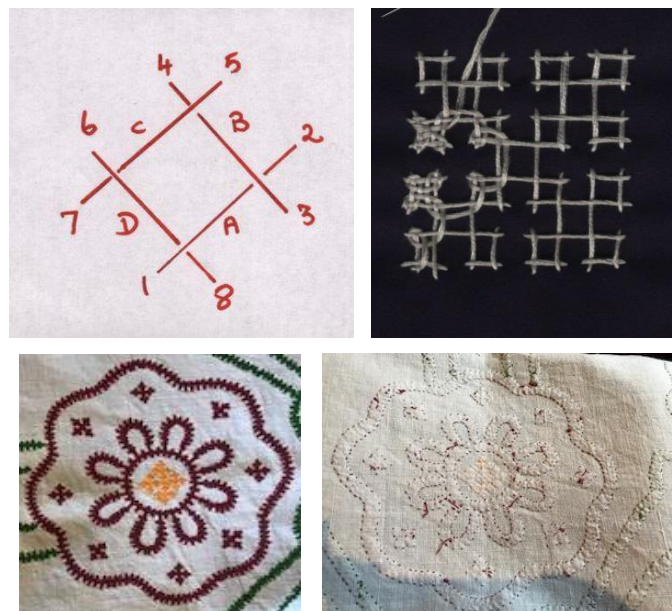
Figure 1. The stages of German embroidery and its right and wrong sides

German embroidery is divided into two groups. The first one is the plain stitch, which is popularly known as atlasloma in other cities as well. The second one is the secret stitch [twisted stitch known as irka (Tokmajian, 2010, p. 5)].