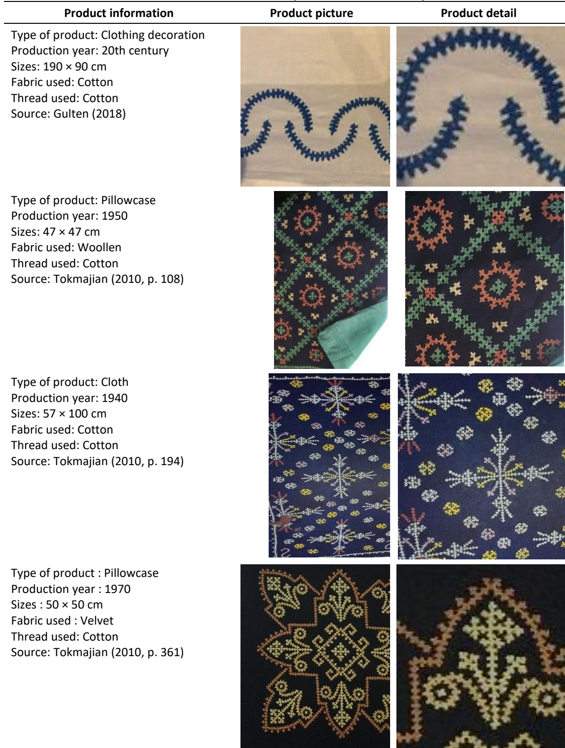
Table 1. German embroidered products chosen as samples