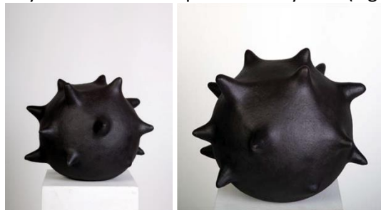
Figure 22. Magna Mater no. 10 (2014). Shaping by mould and hand. Chamotte mud; 31.5 × 31.5 × 27 cm; 1,240°C

Black often represents the night and things that can evoke evil in the mind. 'But this colour is also the colour of divine presence; it has all colours. Hermenists use the phrase black than black to denote the black in the darkness of chaos' (Salt, 2010, p. 299). It is also possible to say that it represents authority, domination and power. In relation to this meaning, it can be said that in this work, in which the artist deals with women, while having a respectable place in the society, his power to speak was taken away and he lived in a patriarchal system (Figure 21).