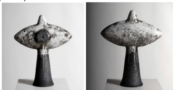
Figure 24. Magna Mater no. 12 (2015). Moulding and turning. Chamotte mud; Raku firing; 31 × 25.7 × 9.5 cm; 1,000°C

It can be said that this work, which can be interpreted as a world dominated by men, emphasises the male reproductive organ formally. The form, which contains visually monumental elements, brings to mind a patriarchal power. We can talk about a society in which women are under the control of men in every aspect, their dignity is lost and men dominate. The circular detail that draws attention in the work can be interpreted as a representation of the fact that it can mean a kind of eye, observation, that it can be connected with perception and that the eye is the name of Osiris, the god of resurrection, and that it can keep everything under control and follow everything anywhere at any time (Figure 23).