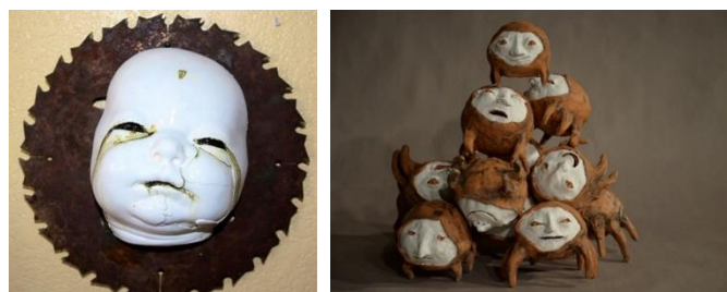
Figure 8. Dystopia, Claudia Roulier, 2011

Certain parts of Laura C. Hewitt's work called Dystopia contain details that lead one to think that she/he is a reptile (Figure 7). The rotating shell of the snail is like the wing of a butterfly. It can be said that the depictions of these creatures in the work of the moment come out of a deep bowl and a small hole reflects their moments of going through a difficult process to the audience. While the preference of these animals may be an indication that their range of motion is due to their rather slow range of motion, it is also known that when the wing of a poultry animal is damaged, its movement is restricted compared to the past.