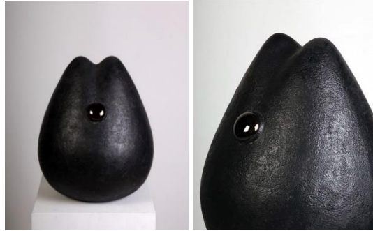
Figure 21. Magna Mater no. 07 (2014). Moulding and hand-shaping; Rosette: Casting clay. Chamotte mud; diameter: 37; height: 42.5 cm; 1,240°C

It can be said that the concept of acquittal is addressed by the use of red in intensity and mould, emphasising the sexual organ of the woman. In this work, the artist may have wanted to emphasise fertility and the fact that women are kept in captivity (Figure 20).