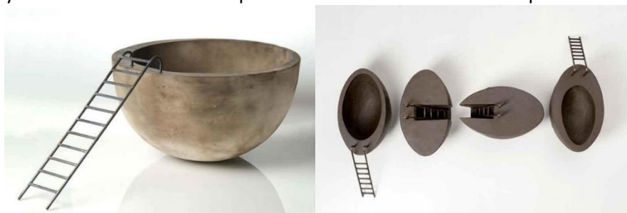
Figure 3. Happy Baskaya, Umut, 2015

on its surface. It is possible that the field flower decorations are positioned as an association with the garden. When it comes to a tea garden, what comes to mind is sipping tea at a table under the shade of the tree. Since justice requires being fair, belief in the just world means that 'people live what they deserve in life; It is a defensive and misleading attribution defined by assuming that bad things happen to bad people and good things happen to good people' (Budak, 2005, p. 15). As a matter of fact, it can be said that when an innocent person finds justice, having tea in the tea garden with his family when he is released from prison coincides with the visual expression of the work.