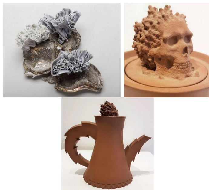
Figure 12. Lauren Skelly Bailey

In Zach Tate's work titled Newts Revenge , the depiction of a human head rising over a closed area with a roof may be metaphorised to try to imprison the human or escape as a manifestation of this. In the graphical representation in the lower part of the work, the mixture of physical characteristics of the dog and pig animal, dressing an animal with horns, glasses and burning cigarette in hand can be interpreted as an indicator of how humanoid features are devalued (Figure 10). In Figure 11, Brautigan's work titled Part of Utopia / Dystopia shows an intertwined, fused, spiral structure. It is known that blue colour often represents the sea and the sky, and with its relaxing effect, it prompts the viewer to peaceful thoughts. It can be thought that the work expresses both directing the surrounding towards the centre due to the holding and hugging movements of the units in the centre like an absorbing vortex and getting rid of it due to the light tone of the edge colours (Figure 11).