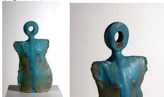
Figure 25. Magna Mater no. 14 (2015). Shaping by hand. Stoneware; 31 × 16.5 × 7.5 cm; 1,230°C

'The eye has often acquired a divine quality, has taken place in beliefs and cultures as the image of the concept of the supreme creator who sees and knows everything' (Ucar, 2019, p. 73). While the protrusion in the centre of the work is used in exaggeration to suggest the dilation of the pupil, the pointed detail at the top can be interpreted as an indicator of the vertex of the triangle and according to the imagery of the eye in the triangle: 'from the great wound, the great architect of the universe' (Ucar, 2019, p. 73) (Figure 24).