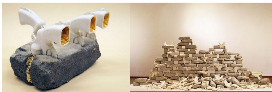
Figure 1. Asli Aydemir, In the Name of Baris, 2013–2015

Utopia wants to make whatever is good, beautiful and useful for humanity ideal for human happiness. In the words of Kumar (2005, p. 12), 'It is never just a dream. It always steps one foot on reality'. The image drawn for the first edition of Utopia is Pieter Brugel's Tower of Babel. The Tower of Babel was built for two reasons. 'The Tower of Babel is the representation of man's transgressions before God, and this must be punished before God. Second, as a general belief, people believe that the use of all modern languages and many ancient languages is inherited from the workers who worked in the construction of the Tower of Babel' ( https://www.academia.edu/7171309/Babil_kulesi_Pieter_Bruegel_esra_bakar ).