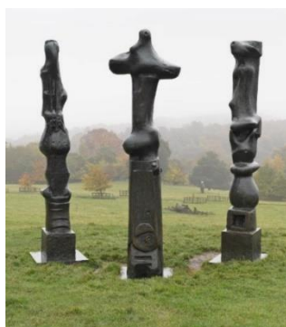
Figure 4. Henry Moore, Upright Motive, 1955–56, Bronze