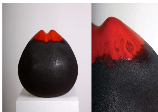
Figure 20. Magna Mater no. 06 (2014). Shaping by mould and hand. Chamotte mud; diameter: 37; height: 39 cm; 1,080°C

The redness scattered on the surface can be interpreted as the menstrual period of a woman and the black surface as covering, being pulled aside, the pressure felt by the woman on her and concealing it. It can be stated that women do not lose their feminine characteristics even if they are taken to the second plan, and they have the continuity and healing aspects of the lineage that are needed in every period (Figure 19).