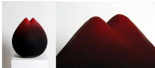
Figure 19. Magna Mater no. 05 (2014). Shaping by mould and hand. Chamotte mud; diameter: 37; height: 39.5 cm; 1,080°C

The redness scattered on the surface can be interpreted as the menstrual period of a woman and the black surface as covering, being pulled aside, the pressure felt by the woman on her and concealing it. It can be stated that women do not lose their feminine characteristics even if they are taken to the second plan, and they have the continuity and healing aspects of the lineage that are needed in every period (Figure 19).