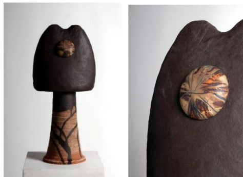
Figure 23. Magna Mater no. 11 (2015). Forming by hand and turning; Rosette: Casting sludge, Sagar firing. Chamotte mud; 41 × 19 × 13 cm; 1,240°C

It can be said that the protruding surfaces in this work, which gives a feeling of discomfort at first sight, evoke the movements of a baby in the womb. These surfaces can be interpreted as an indicator of a tight abdomen and the hands and feet of the baby who is constantly in motion. It can also be claimed to be a microbe or an organic substance. In this context, the blackness of the work can be said to be an indication of the suffering of the woman or the manifestation of the troubled process she was in (Figure 22).