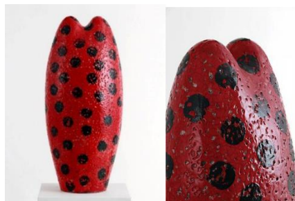
Figure 17. Magna Mater no. 03 (2014). Shaping by mould and hand. Chamotte mud; 69 × 31 × 22 cm; 1,080°C

It can be thought that artist EFE Turkel in his work no. 01 considers the rounded contours of the female body in terms of shape. It can be stated that the cracked texture on the surface is interpreted as a representation of the abused body of the woman, although it brings to mind the thought of being worn out and wrinkled. In this context, it can be said that the seal in the middle of the work, on which the emphasis was made, brings to mind the ideas of belonging, pegging and stigmatisation (Figure 16).