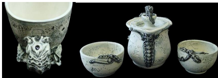
Figure 7. Laura C. Hewitt, Hybrid, Dystopia details

In Figure 6, it is seen that Hoffman Ruan in his work titled Dystopia has blue decorated surfaces applied to the ceramic surface, and has written dystopia in the central part of the work. This written area is confined to the lines and can be interpreted as the impossibility of leaving the area considered to be closed in terms of the relationship of the direction of the lines to each other.