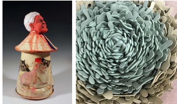
Figure 10. Zach Tate, Newts Revenge , 2017

(Figure 9). As a matter of fact, new born animals that have not yet completed their development climb on each other or bump into each other to keep warm. The creatures in the work can be compared to spiders due to their numerous feet, their climbing high and their bodies consisting of head and feet. The spider can be interpreted as a hardworking creature that weaves a web at almost every opportunity and when evaluated from this aspect, it is not allowed to weave nets indoors. Since the creatures in McNamara's work can be thought to be in contact with the soil due to the colour of their surfaces other than the face, it is known that many high-climbing legs are brought down by humans at any moment, while bringing to mind the creation and death of beings.