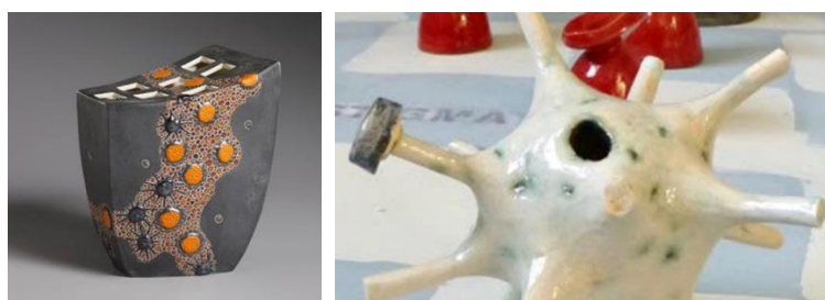
Figure 14. Sasha Bakaric, Virus Vase, 2016

In the work of Richard Notkin, titled Cooling Tower , as shown in Figure 13, there is a full, non-functional teapot, and when it is considered functional, there is a skull in the place where its mouth should be a handle (Figure 13). Most of the time, the skeleton that evokes death also presents with the act of drinking, loss of appetite etc. It can be said that it contrasts with an eating and drinking object since it will give feelings.