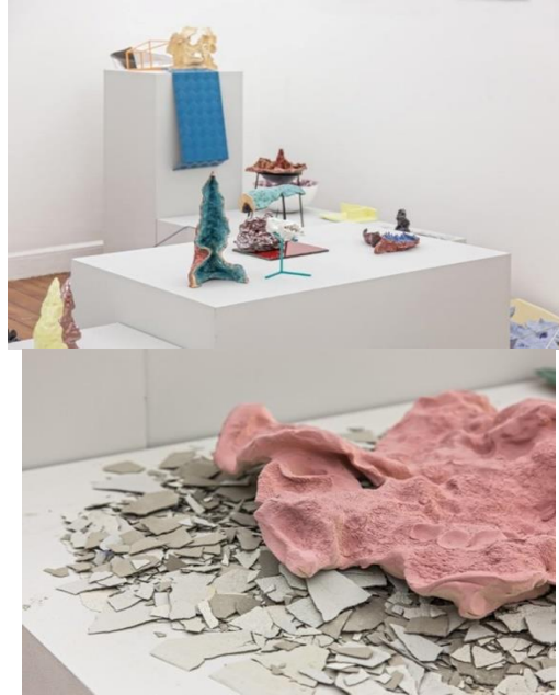
Figure 5. Emre Huner, Anthropophagy details , 2013