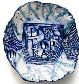
Figure 6. Hoffman Ruan, Dystopia, Mutualart, 2017

In Figure 6, it is seen that Hoffman Ruan in his work titled Dystopia has blue decorated surfaces applied to the ceramic surface, and has written dystopia in the central part of the work. This written area is confined to the lines and can be interpreted as the impossibility of leaving the area considered to be closed in terms of the relationship of the direction of the lines to each other.