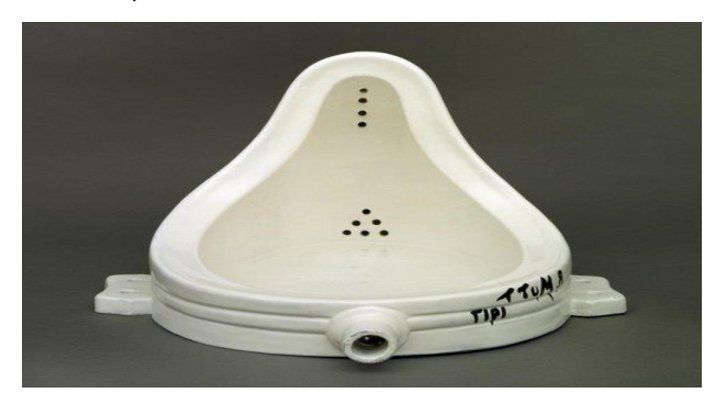
Figure 2 MARCEL DUCHAMP "Fountain", 1917