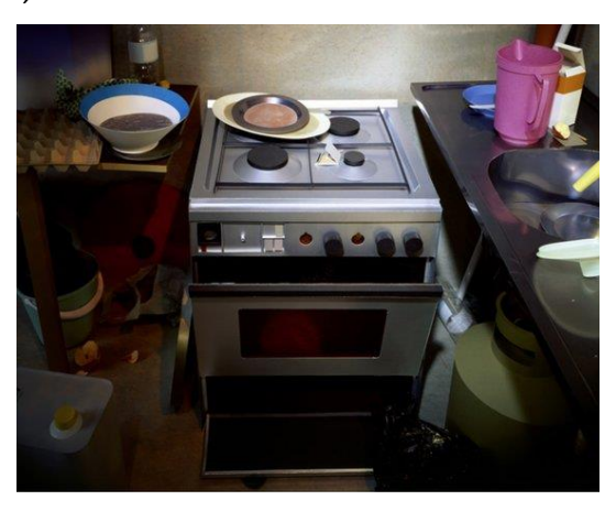
Figure 4 THOMAS DEMAND "Kitchen",2004

Hanafy, I. (2024). A critical study of conceptual art. Global Journal of Arts Education . 14(1), 45-51. https://doi.org/10.18844/gjae.v14i1.9333