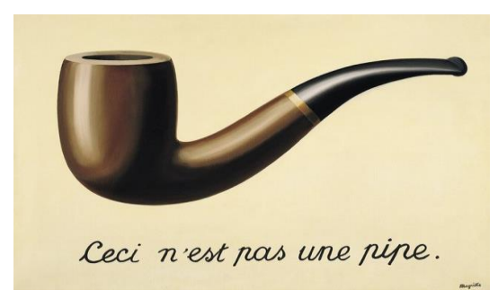
Figure 1 RENÉ MAGRITTE "The Treachery of Images", 1928

Source: Magritte, Passeron & Weidner (1986)