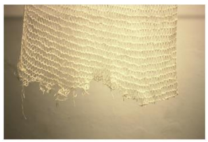
Figure 5. Ifigeneia Ilia-Georgiadou (2020). Installation 'Damnatio memoriae.' Detail.

The artist herself says: 'This work is a knitted wall hanging installation measuring 80 by 39 cm.' The work was inspired by the Latin phrase 'Damnatio memoriae' used as a punishment in Roman society (Figure 5). 'The texture of the knitted piece exhibits a certain repetitiveness and an automated quality, as its creation is the result of a continuous motion that