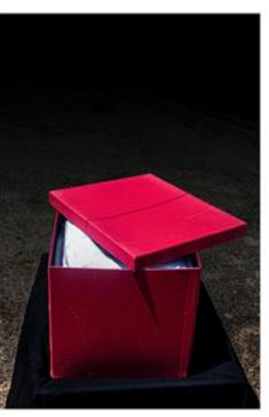
Figure 3. Vasso Florou (2019) – The box marked 27 November 2018 (24 hours).

The work of Ifigeneia Ilia-Georgiadou (2020) depicts the content of condemnation of memory itself in the form of the trace, which is not unaltered, but which can be rearranged, modified and lost. An event takes its place within a