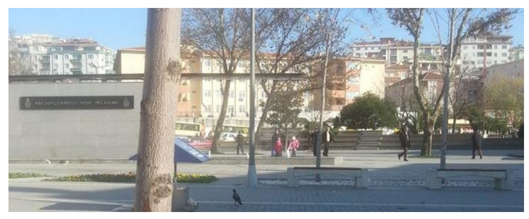
Figure 5. Kucukcekmece Urban Square (H.B.BULUT)

• Water feature in the square catches people's attention, especially children's.