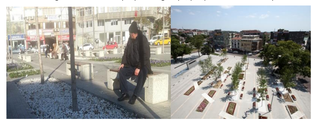
Figure 6. Kucukcekmece Urban Square (H.B.BULUT)

• Seating benches are not proper for groups, people sit alone usually.