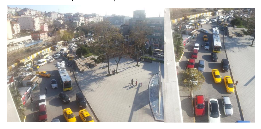
Figure 7. Kucukcekmece Urban Square (H.B.BULUT)

Traffic is heavy around the square all time.