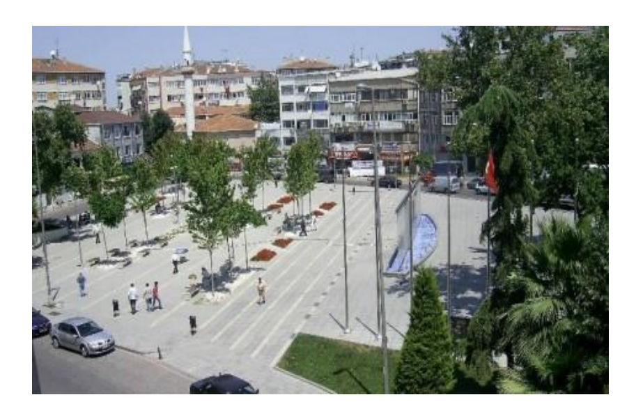
Figure 2. Kucukcekmece Urban Square (C. Cangul)

voice on the square, to enable accessibility for disableds and to put the urban square which becomes integrated with Mimar Sinan Bridge into use (http://www.buyukhaber.com/m/?id=4903).