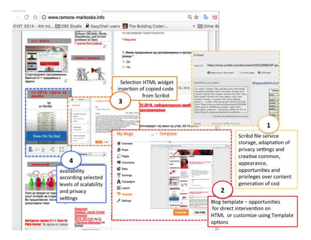
Figure 3. Process of content creation using configurable widget

In both of described options, depending on services where those content are stored, there are some recommended procedures for realization of embed options. Independently of embed place on the main resource, (blog post or imported widget), it should be defined and described opportunities and privileges over content, as a star point of process of embed code generation. Digital educational ecosystem might be composed from many independent, but functionally linked platforms, such as other blogs, in this case study: