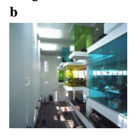
Figure 1. (a) Japanese House, Japan; (b) Bishan Public Library, Singapore