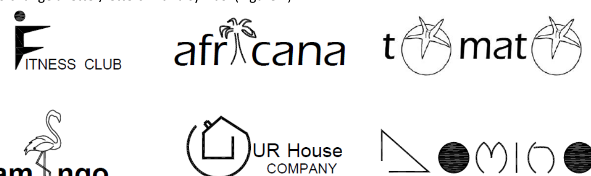
Figure 2. Examples concerning this principle

To change a letter/letters with a symbol (Figure 2).