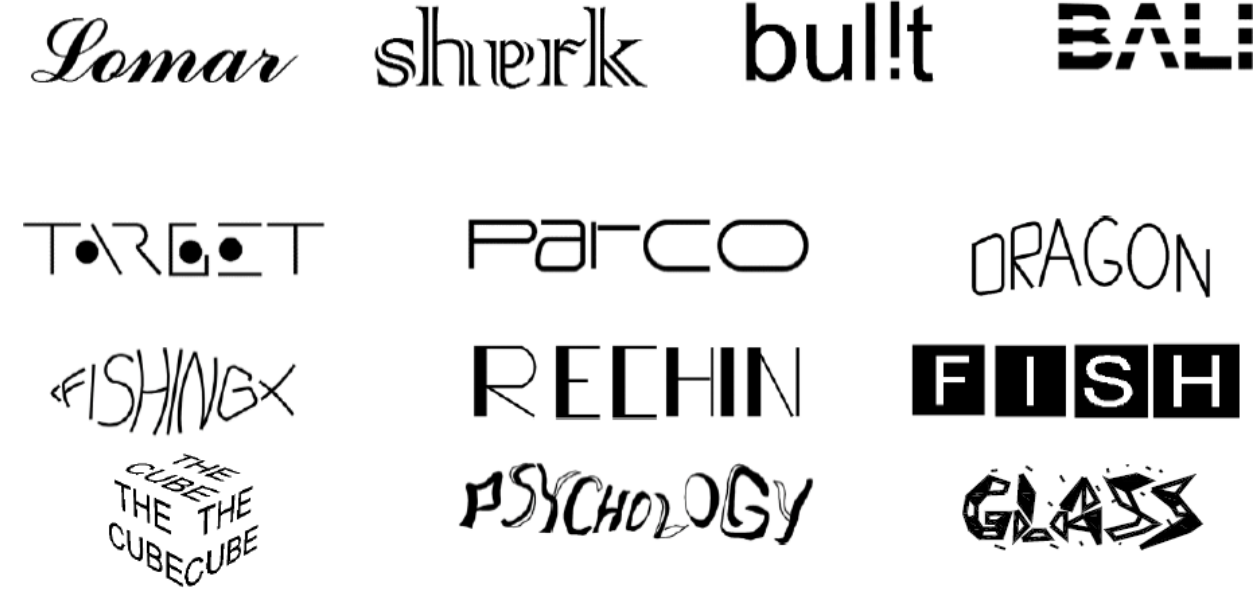
Figure 1. Examples of logos

About using words, we have presented some representative examples of writing a logotype. In Figure 1, there are a few examples included in our work.