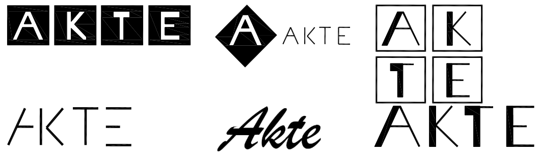
Figure 7. Examples for the principle