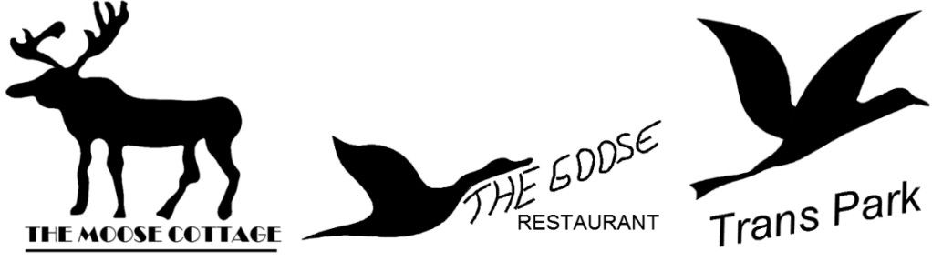
Figure 14. Examples for the principle

To use graphic silhouettes of people, animals, things etc. (Figure 14).