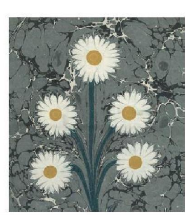
Art of Tile (China), p.89 Marbling Art, p.89

7.2.5.: 'Give examples of Ottoman culture, art and aesthetics. Examples of travels from local and foreign travellers are included.' In this section, it is seen that the subject is explained in the eyes of travellers. Just as in the 5th grade social studies textbook, photographs about architectural structures are also in the foreground.