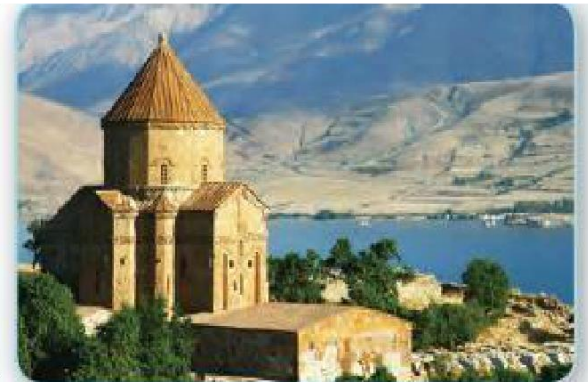
Safranbolu Houses, p. 41 Akdamar Church, p. 44