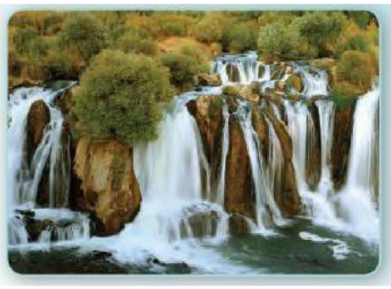
Hanging Gardens of Babylon by Maarten van Heemskerck, p. 39 Muradiye Waterfall, p. 44

There is no clear visual indication of The Hanging Gardens of Babylon. For this reason, it has become difficult to establish a connection between students and aesthetic objects. However, the table in question contains many aesthetic details. In the shared statement about the Muradiye Waterfall, flowers that bloom around the waterfall in the summer season were mentioned (Flowers blooming in summer add a different beauty to the waterfall, p. 44). However, there are no flowers in the image given. Therefore, aesthetic value teaching is extremely lacking and problematic in these parts.