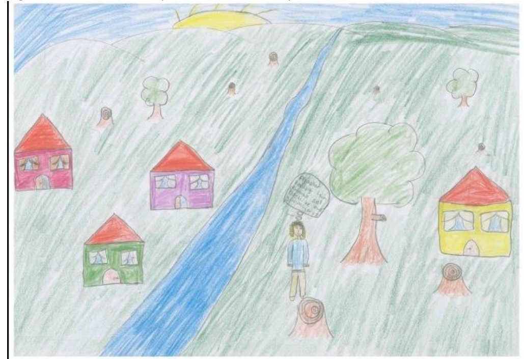
Figure 3. One of the examples of the students' pictures