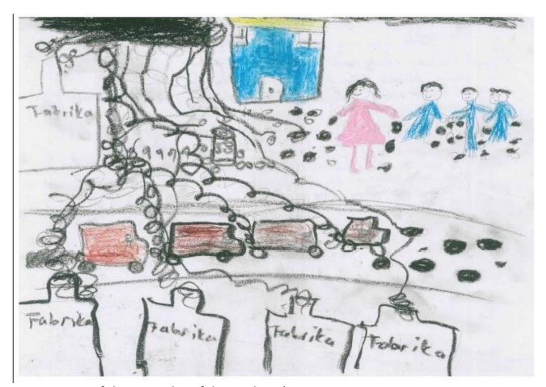
Figure 2. One of the examples of the students' pictures