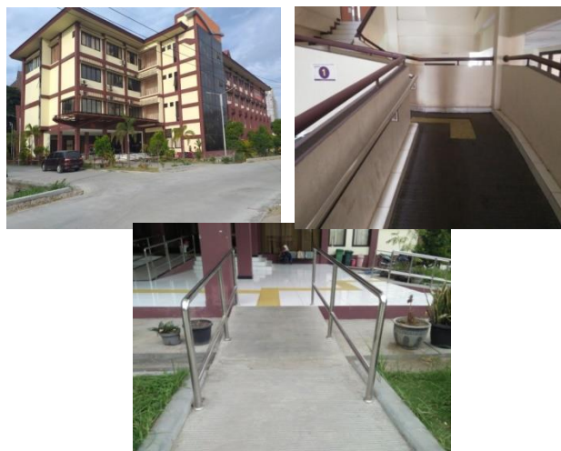
Figure 3. Visual impairment accessibility area in special education department building

Based on the five stages used in the development research procedure, the results of the prototype product model show the social mobility orientation and communication based on android applications in understanding the concept of campus environment for visually impaired students (Figure 3).