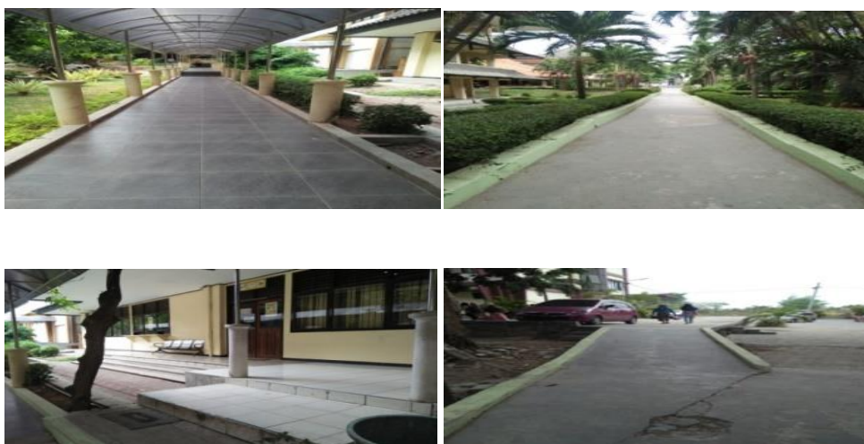
Figure 2. Campus Environment of the Faculty of Education, Universitas Negeri Surabaya

The audio programme for the road route guidance is equipped with clues or signs that can be used as a benchmark for visually impaired students during mobility, such as a sign or clue contained in the campus environment for mobility in the department of Special Education, Faculty of Education staff office, faculty's library as well as tangible stairs, the edge of the park and the road surface. Figure 2 shows an illustration of the sign or clue contained within the campus in the Faculty of Education, Universitas Negeri Surabaya.