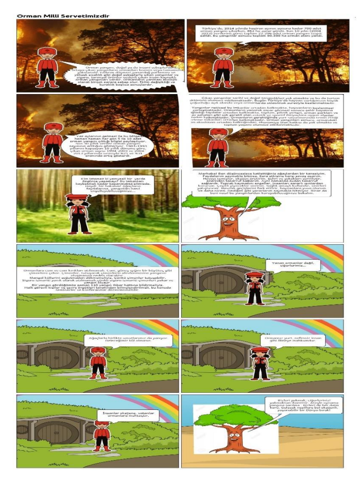
Figure 1. Melisa İdil's informative comic books

Figure 1 shows an informative comic book created by a student named Melisa İdil nickname. In this article, Melisa İdil gave information about the importance of forests and the damage of forest fires. It has benefited from numerical data when presenting its information. Other students like Melisa Idil have also created and presented their own texts. While presenting the texts of the students, other students were asked to carefully watch and criticize the text. The students were criticized in terms of the purpose and subject harmony, the structural order of the text, spelling and punctuation, incoherency. The criticisms of the example text in Figure 1 are presented below. These sample evaluations attempted to elucidate which deficiencies are more common in students.