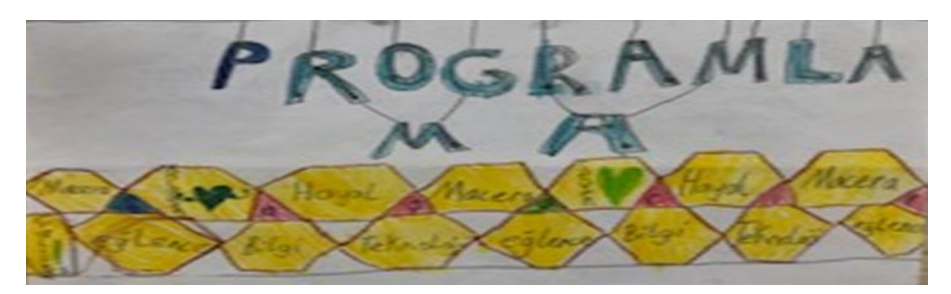
Figure 3. S;U;C;C;E;S;S with the mobile programming education

"The poster" drawn by a student can be seen in Figure 3.