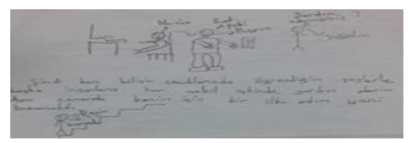
Figure 4. First step into the world of information technology with the mobile programming education

The drawings of a student which shows that he dreams of helping others with the mobile programming education and emphasizes that this education is a first step that can guide his future life are seen in Figure 4.