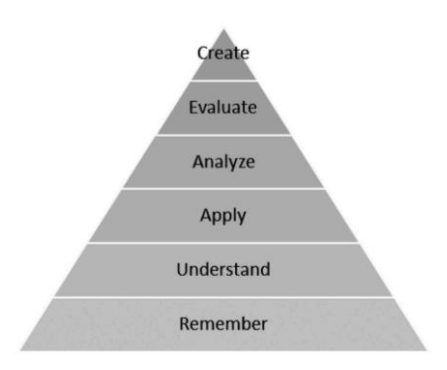
Figure 1: The revised Bloom's Taxonomy in cognitive domain

One of the uniqueness of the taxonomy is that the cognitive level may represent other levels. Namely, in analyzing phase people could also perform in remembering, understanding, and applying steps (Airasian & Miranda, 2014). The taxonomy was a part of the standard feature in the assessment methods in every item question of the test. Bloom's Taxonomy in 1956 (Bloom, 1956) and its revised version have been regarded as "a practical guideline in constructing good exam questions associated with generating enquiries (Lister & Leaney, 2003), appraising pupils' cognitive mastery (Oliver, Dobele, Greber, & Roberts, 2004), textbook appraisal (Parsaei, Alemokhtar, & Rahimi, 2017; Razmjoo & Kazempourfard, 2012; Sahragard & Zahed Alavi, 2016) and defining examination questions on the cognitive domain (Chang & Chung, 2009).