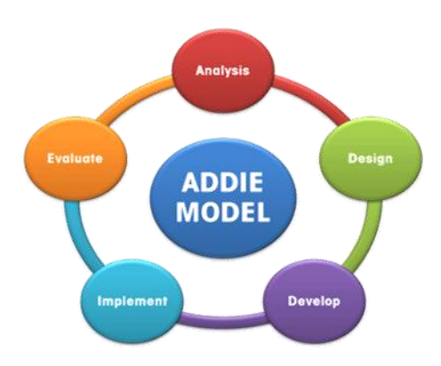
Figure 1 Model ADDIE

The ADDIE (Analysis, Design, Develop, Implement, and Evaluate) methodology was employed throughout the process of designing this module as the development model. This model was selected because the ADDIE model is frequently used to describe a methodical strategy for the development of educational programs (Dick et al., 2001; Dick et al., 2009). The visualization of the ADDIE model is as follows (figure 1):